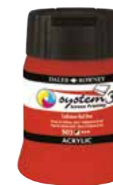
System3 Screen Printing Acrylic 2.50ml D 141 250 ***