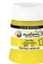
System3 Screen Printing Textile Acrylic 2.50ml D 142 250 ***